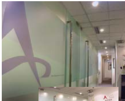
Acumen Group's new office at Sunning Plaza 1st floor

The interior is executed in the same dynamic and modern manner, employing a varied range of materials including stainless steel, frosted glass and aluminum to enhance the image of a cutting edge and vibrant consulting firm.