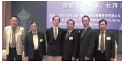
在上海舉辦之「內地企業如何前往境外上市」研討會上，我所董事與海外嘉賓合影

有見於許多國內私企有意向境外發展及融資，我所籌辦了一個以「內地企業如何前往境外上市」為主題的研討會，在2006年5月18日於上海四季酒店舉行。該研討會並得英國CLB Littlejohn Frazer 會計師事務所及加拿