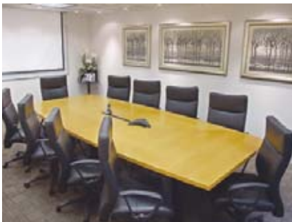
The new board room

The core design concept of our new office is to create an environment that is both inviting for clients and functional for employees.