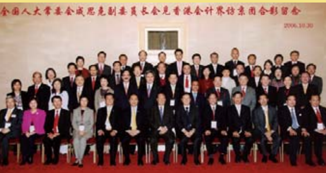
29-31.10.2006 The Hong Kong Accounting Profession Delegation to Beijing 香港會計界訪京團