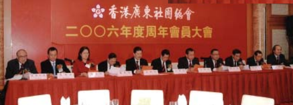
8.12.2006 Federation of Hong Kong Guangdong Community Organisation Ltd Members' Annual Meeting 2006 香港廣東社團週年會員大會2006