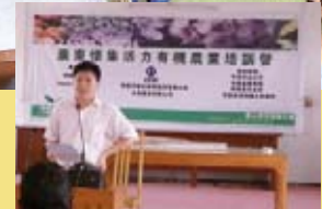
19-21.5.2006 Hong Kong/Huaiji/ChengDu Biodynamic Workshops organised by Green Field Foundation and sponsored by CCIF 由「陳葉馮」贊助之「香港/廣東懷集/成都活力有機農業培訓營」活動剪影