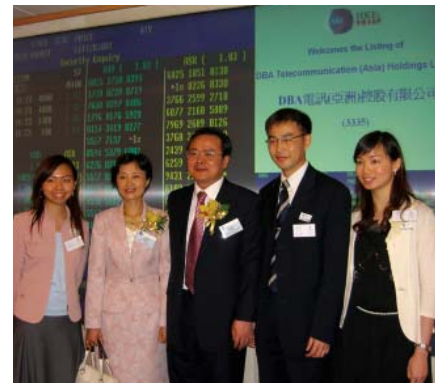
Our IPO working team with Board Members of DBA Telecommunication (Asia) Holdings Ltd. at the listing ceremony

During the past 5 years, we have successfully guided 25 of our clients in Hong Kong and PRC with their listings. We are now auditors of 75 listed companies.