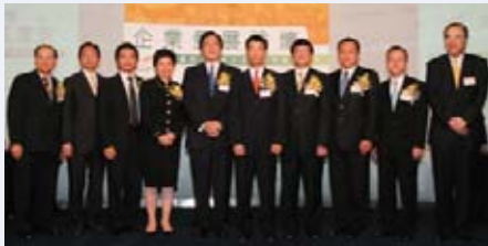
Hong Kong Productivity Council's Corporate Development 'Going Global' Seminar

Disclaimer: The content in this publication is of general information only. It is not offered as advice and should not be taken as such. We expressly disclaim all liabilities to any person for any reliance placed on the contents of this publication. No client or other reader should act or refrain from acting on the basis of the contents of this publication without seeking specific professional advice.