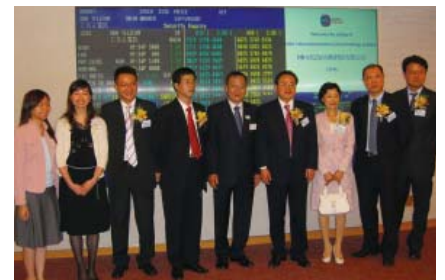
DBA電訊（亞洲）控股有限公司上市日，「陳葉馮」工作團隊成員與上市公司管理層攝於上市儀式

我們很榮幸擔任集團的獨立申報會計師。過去5年，我們成功協助25間香港及國內企業上市，並為75間上市公司的年度審計師。