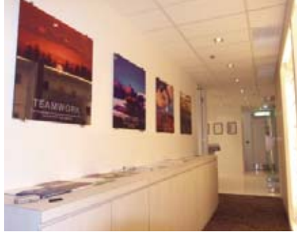
Corridor to main office with inspiring posters custom-made for our office

We recognise the importance of environmental protection. Therefore, when setting up our new office, where possible, we endeavoured to recycle and re-use fittings and fixtures so as to minimize wastage and lessen the burden on the environment.